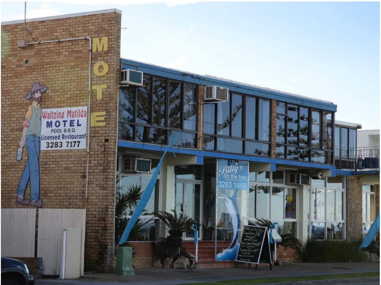
📷 The former Waltzing Matilda Hotel.

Traders in Purple have transformed it into Bathers Beachside apartments.