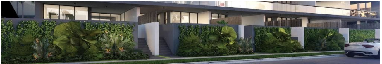
📷 Bathers Beachside at Margate Beach.

All apartments are three bedrooms, with two bathrooms and secure car spaces, an outdoor entertaining area, and plenty of storage.