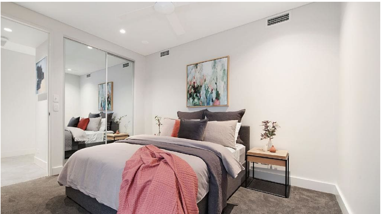
📷 The bedroom in the new Bathers Beachside unit complex at Margate by Traders in Purple.