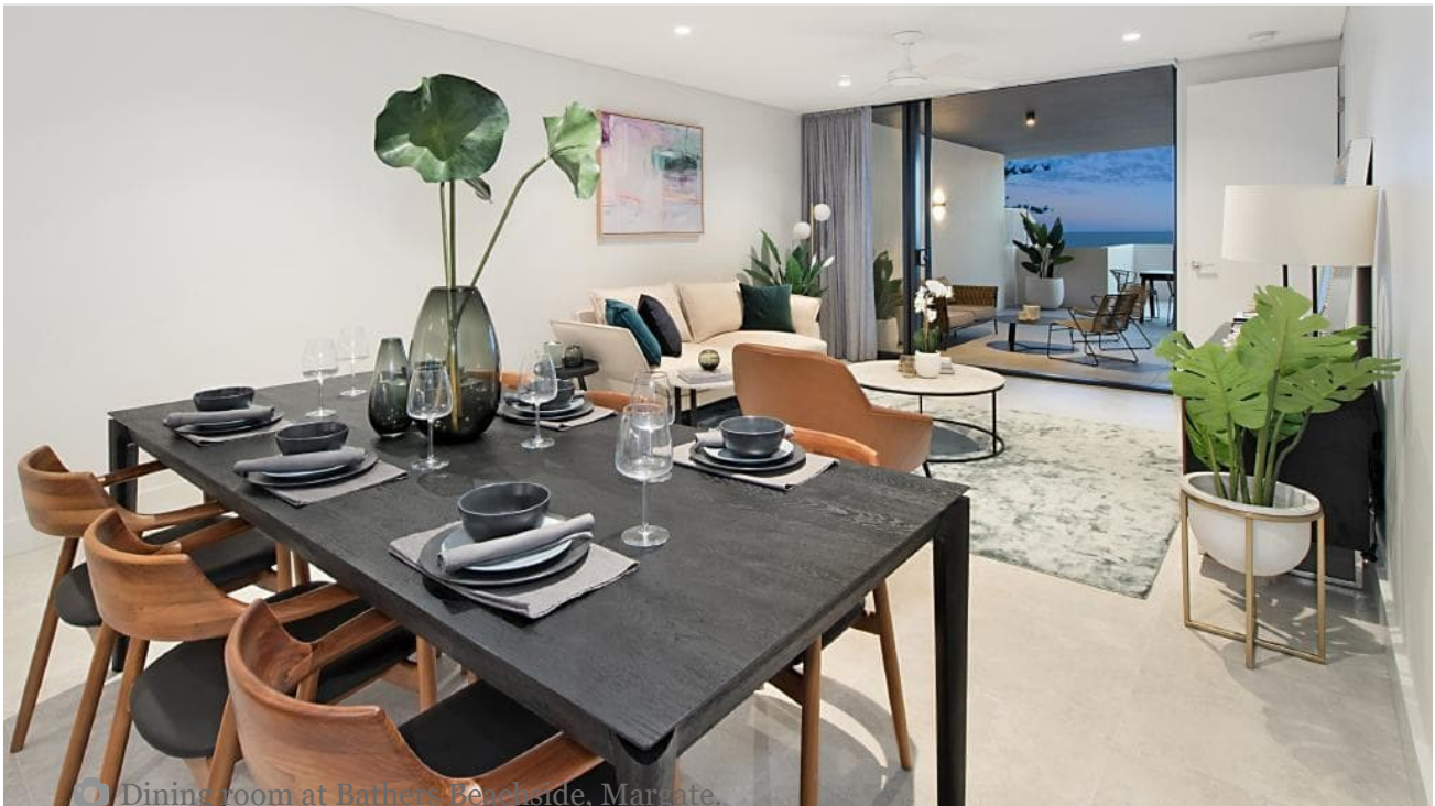
Dining room at Bathurst Beachside, Margate.