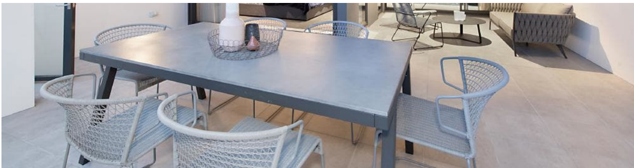
📷 Outdoor area at the new Bathers Beachside at Margate by Traders in Purple